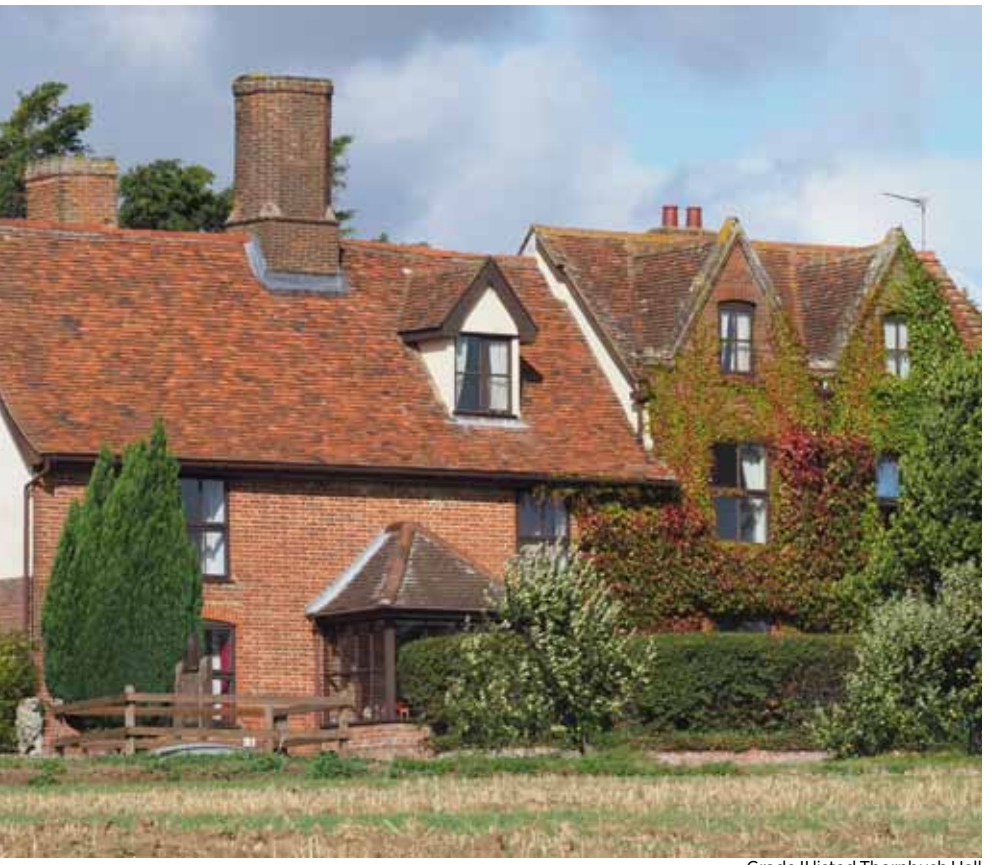
Grade II listed Thornbush Hal