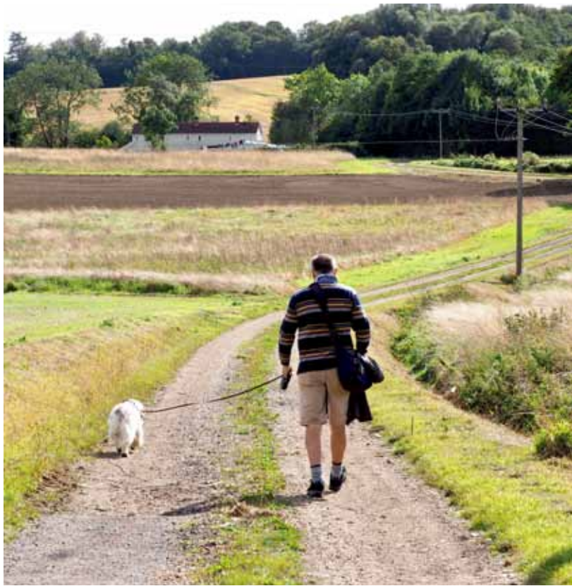
Heading towards The Grindle

matured. Like most Clumber spaniels, he has a stubborn streak but he's developed into just what The Clumber Spaniel Club predicts. "He will take about two to three years as a wild and loving youth before settling down into a truly aristocratic, good natured, dignified companion who, when he senses the time is right, will play the clown."